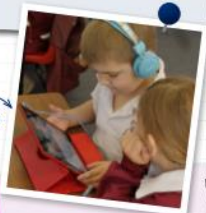
Uses a tablet to sequence steps