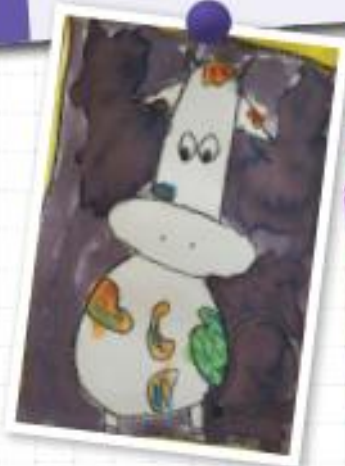
Creates artworks by drawing and painting